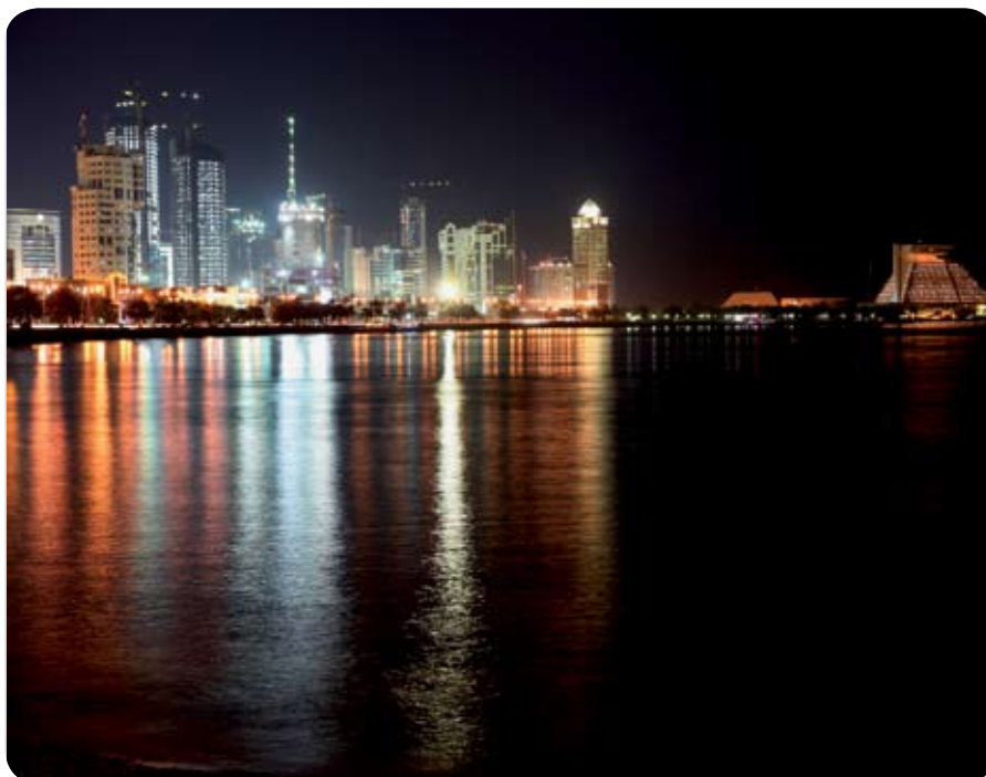
Bright lights, big ambitions: Doha West Bay, home to the Qatar financial district

I think every one of the staff here is highly driven by this unique experience of playing a part in nation-building, including writing the laws. Over 80 per cent of us have been sourced from within Qatar, 60 per cent are female and almost all have long experience of working in the Middle East. We also have an intern programme for graduates of